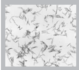
Electron microscope photo of Super Finavinx magnetic particles

DAT 72 features the highest recording density of any data tape* 1 . As a result, DAT 72 data cartridges must be constructed with a magnetic layer that can record extremely short wavelengths. That's why TDK employs ultra-fine Super Finavinx metal magnetic particles, exclusive high \sigma_s technology that TDK specially developed for DAT 72. The " \sigma_s " indicates each particle's magnetic energy; a high \sigma_s value means each particle has superior ability to record and store the magnetized data signal. The \sigma_s of TDK DAT 72 tape, 156emu/g* 2 , represents a significant improvement over the 143emu/g of TDK DDS-4 tape. And because the Super Finavinx particles are packed on the magnetic layer in high density and with exceptional magnetic orientation uniformity, the DAT 72 format's short wavelength data signals can be recorded with total reliability.