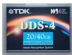
DC4-150S (recording capacity: 20GB*)