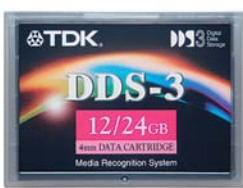
DC4-125S (recording capacity: 12GB*)