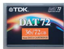
DC4-170S (recording capacity: 36GB*)